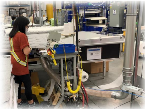
Serging and flanging machines.