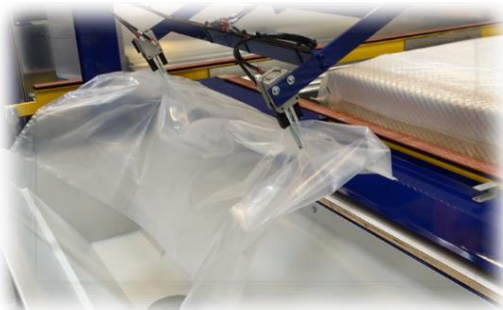
PVC from mattress packing.

As new technology is making the way in to the industry and labor cost is going up, it makes sense to automate the waste handling process. New hi-tec. equipment produces faster and makes more waste. The operators time is spending time to remove waste instead of concentrating on the machine performance. Removed waste takes a lot of floor space around the machines.