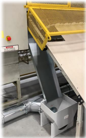
Panel and border quilting.