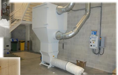
Compressed in bags